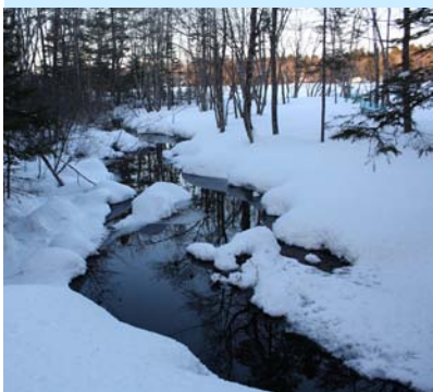
A beautiful winter scene