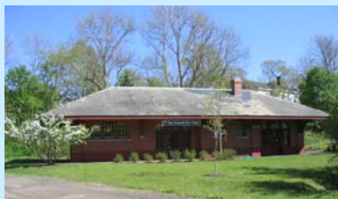
CARP Office - Annapolis Royal train station.