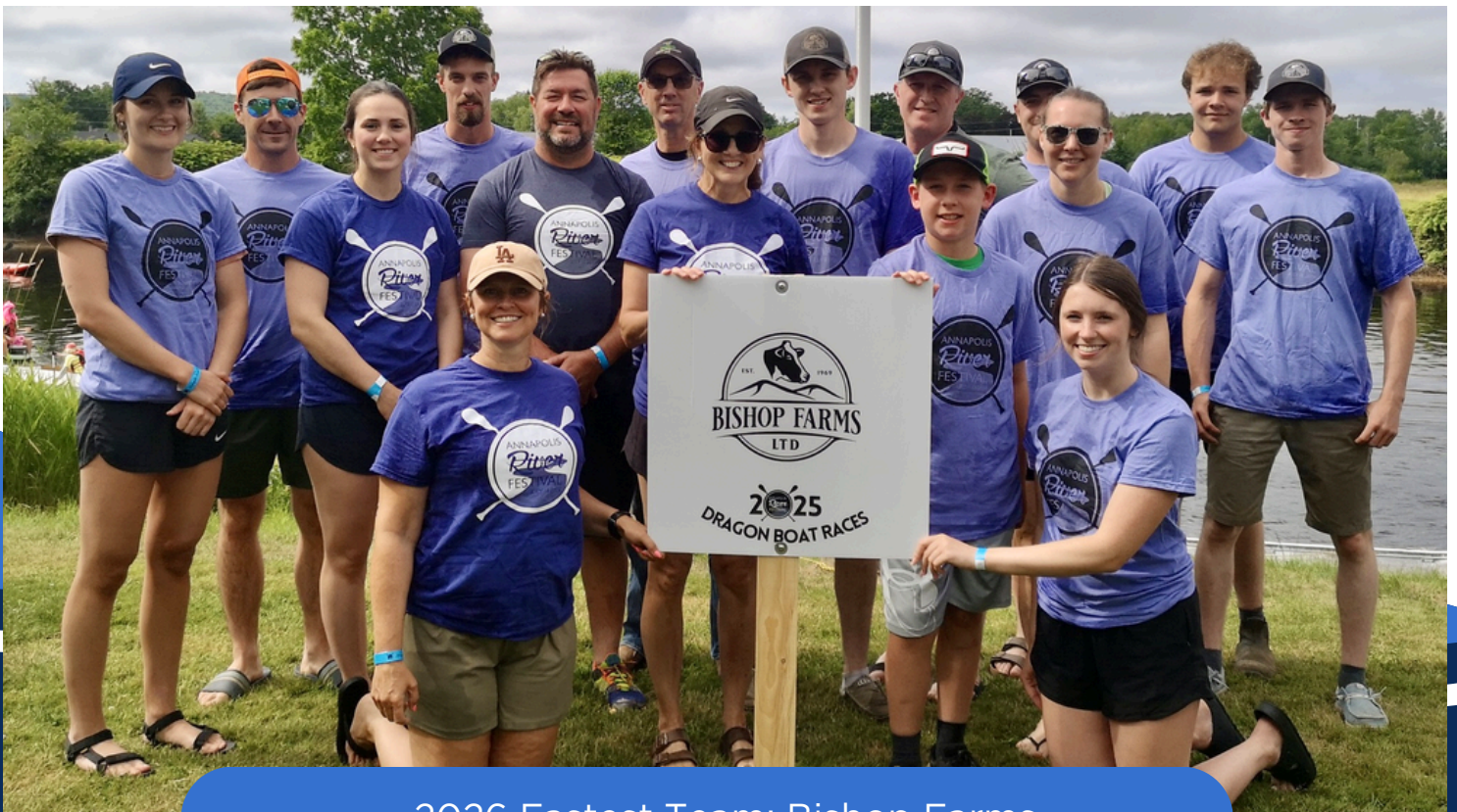
2026 Fastest Team: Bishop Farms